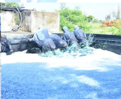
PEDALLING THE WATER 2 to 3 Hours and OXIDATION IS DONE AND LEAVE IT OVERNIGHT