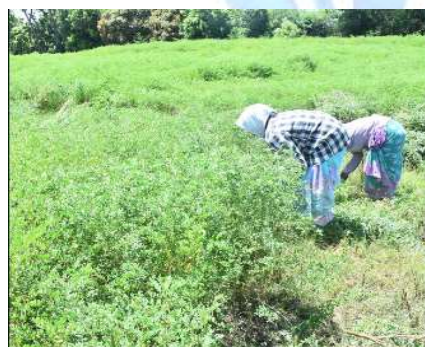
HARVESTING NATURAL INDIGO LEAVES (INDIGOFERA TINCTORIA)