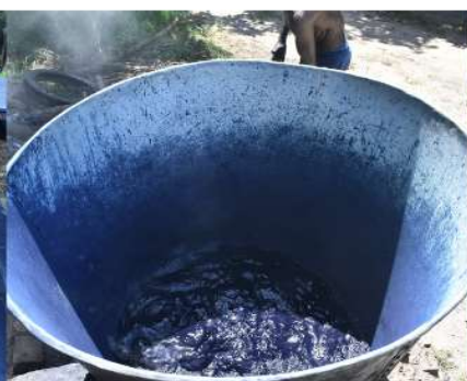
BOILING THE INDIGO PASTE, FILTERS THE INDIGO PASTE & PRESSING AND LOCKING