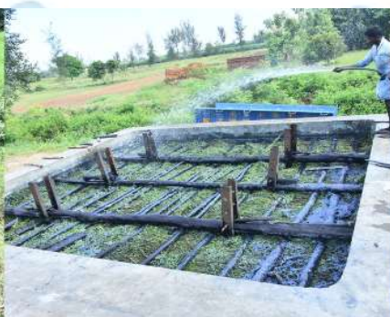
FILLING THE TANK WITH FRESH LEAVES & TIGHTENING AND SOAKING THE LEAVES OVERNIGHT