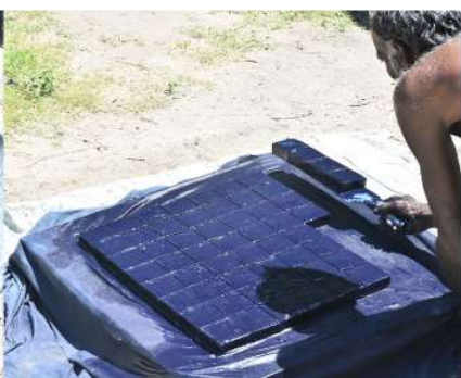
SLICING THE CAKE FOR DRYING