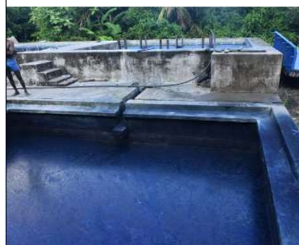
COLLECTING THE INDIGO PASTE